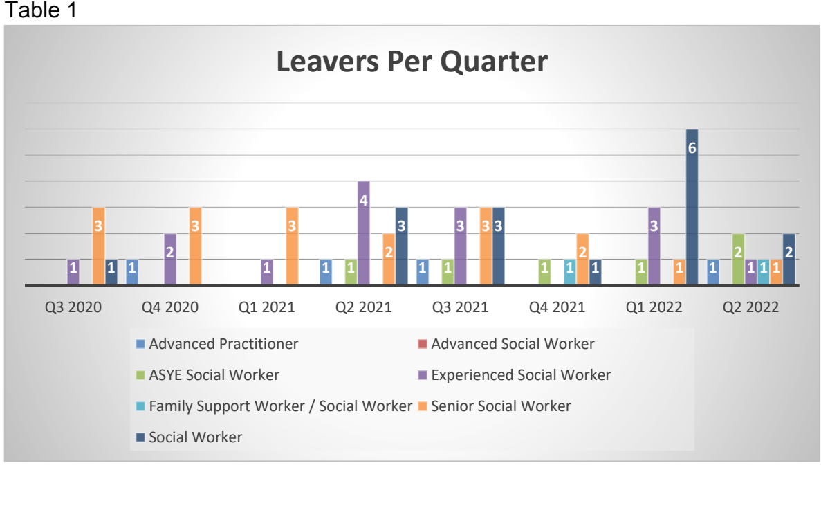
Table 1 below demonstrates the turnover and churn of social work staff. There are currently 149 social work roles in Barnsley of which 74 staff are in front line social work roles i.e., Assessment (9) Children and Young People's Services (45) and Disabled Children's Team (12) and Children in Care (8)

It is clear the highest leavers are in front line practice.